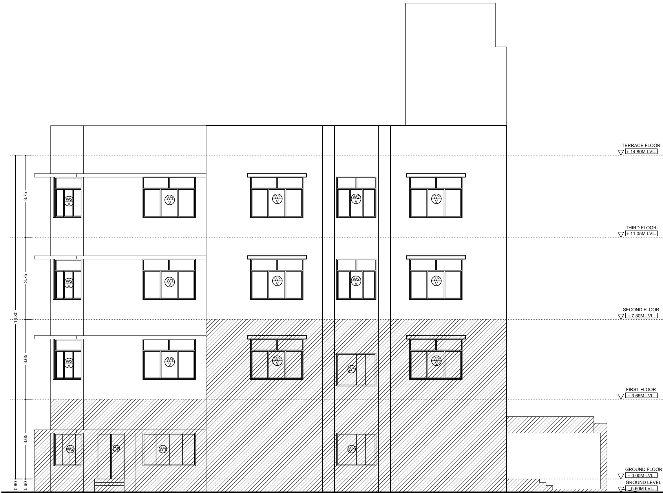
ELEVATION - II